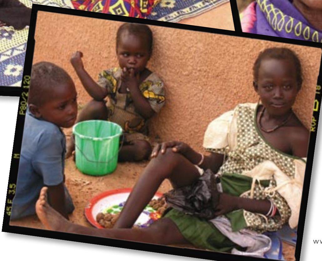
Left page: Villagers await grain distribution. Right page, from top: Grain sacks, a mother with ill child, villagers.