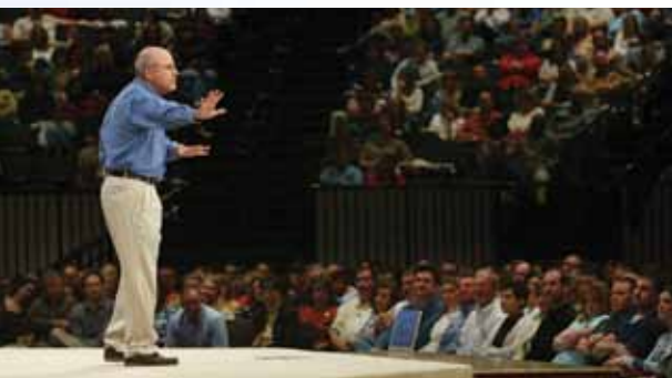
Dave Ramsey speaks to a crowd attending his Financial Peace seminar in Nashville, Tenn.

cial straits. That evolved into The Dave Ramsey Show , a national broadcast that continues today with the frank and humorous host serving as a personal money management expert.